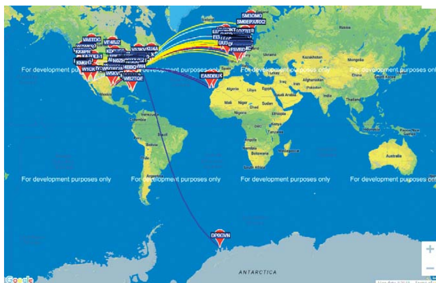
Figure 8 — A wspnnet.org map display of stations receiving some of my 80-meter WSPR beacon transmissions.

I tested WSPR operation with both the 40- and 80-meter versions of the QCX transceiver. Some 40-meter reception reports from wspnnet.org are shown in Figure 7. For example, the top line shows that at 0944Z on May 29, N111 in FN31 was heard on 7.040012 MHz