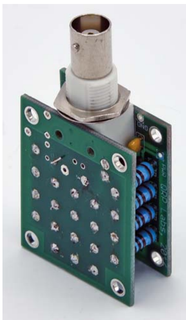
Figure 9 — The dummy load consists of a sandwich of two printed boards with 20 resistors in the middle. A BNC connector, diode, and capacitor are mounted to the lower board.

In the package are 22 identical resistors. After mounting 20 resistors, one of the spares is used as a jumper connecting the two boards. The diode and capacitor act as a peak voltage detector, which you can use with a standard high-impedance digital voltmeter (DVM) to get an approximation of transmitter output power. At the end of